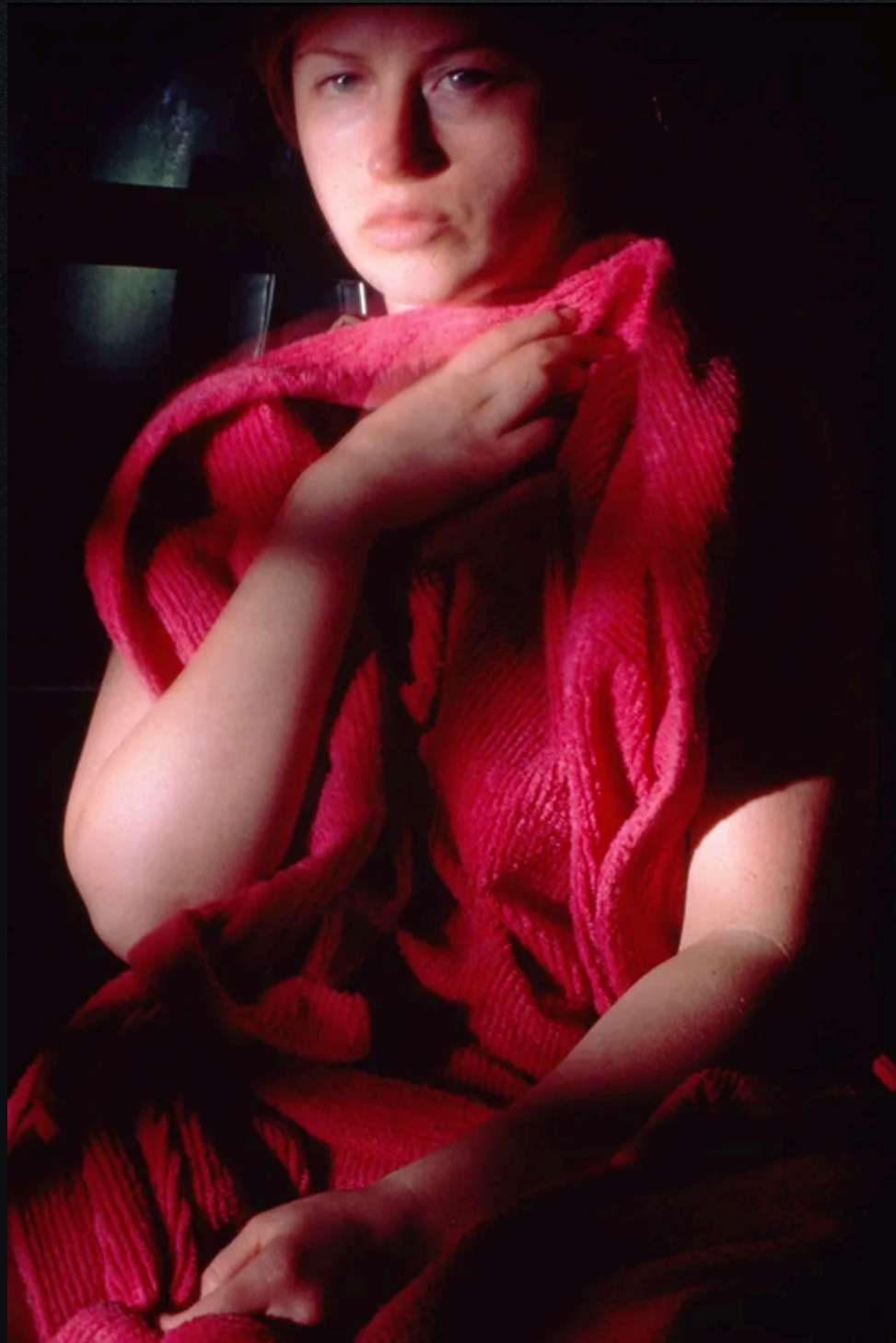
Untitled #99 Cindy Sherman

Cindy Sherman's artwork Untitled #98 , 1982, is part of a group of four images now known as her "Pink r]Robe" series, featuring Sherman posing under a pink chenille bathrobe. Sherman began using color photography around 1980. It immediately pushed her to explore a new style of self-portraiture that was less obscure and enigmatic than her earlier black and white work. Sherman appears without make-up or costume in this series, while the robe suggests a moment of private intimacy. Critics have suggested Sherman shows us her "real," vulnerable self in these images, looking at us directly with an unflinching stare. However, in the entire series of four images, a subtle, fictional narrative is created where Sherman becomes increasingly hostile, defensive, and shrouded in darkness. We are reminded that a photographic image is always an act of staging, artifice, and theatricality. ( How Cindy Sherman Redefined Self-Portraiture (7 Artworks) | TheCollector ).