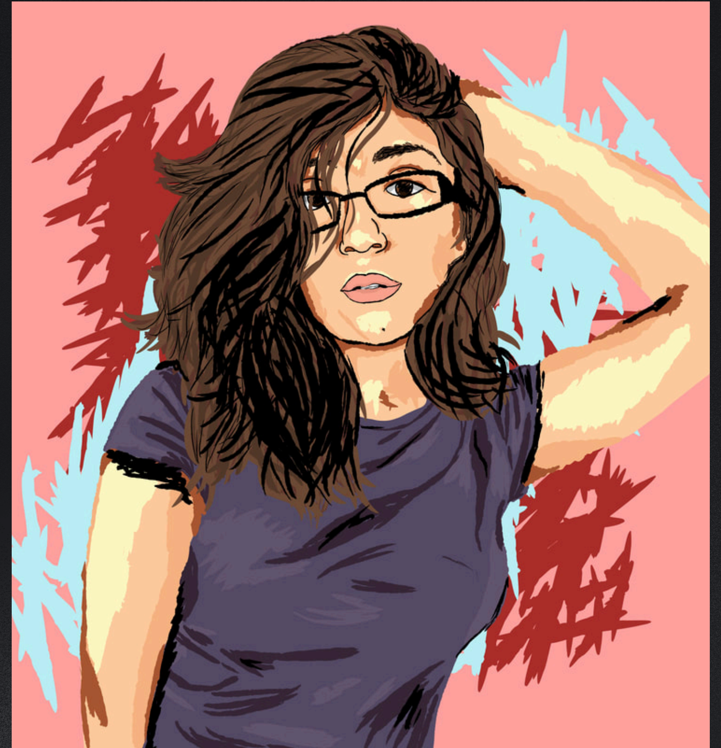
"i'M a MeSs", Medium: Digital Illustration, Size: 36 in. x 36 in., October 15, 2017